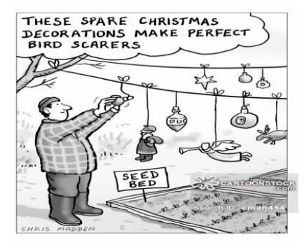
Idyllwild's Demonstration Garden Group By Julie Roy

<u>Idyllwild Demonstration Garden News:</u>